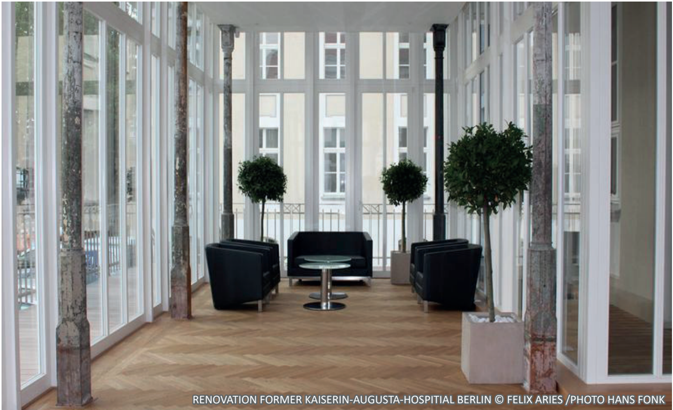
RENOVATION FORMER KAISERIN-AUGUSTA-HOSPITAL BERLIN